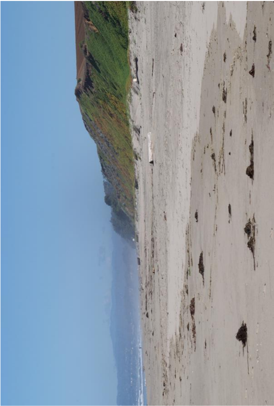
Playa de Arena